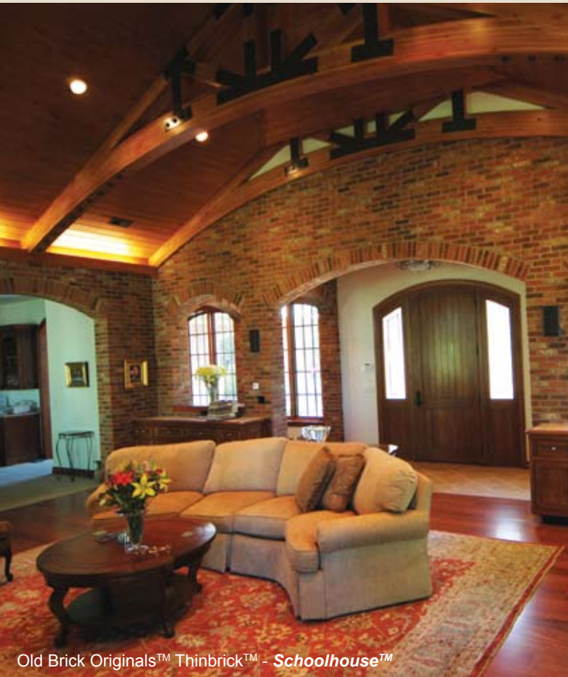
Old Brick Originals™ Thinbrick™ - Schoolhouse ™