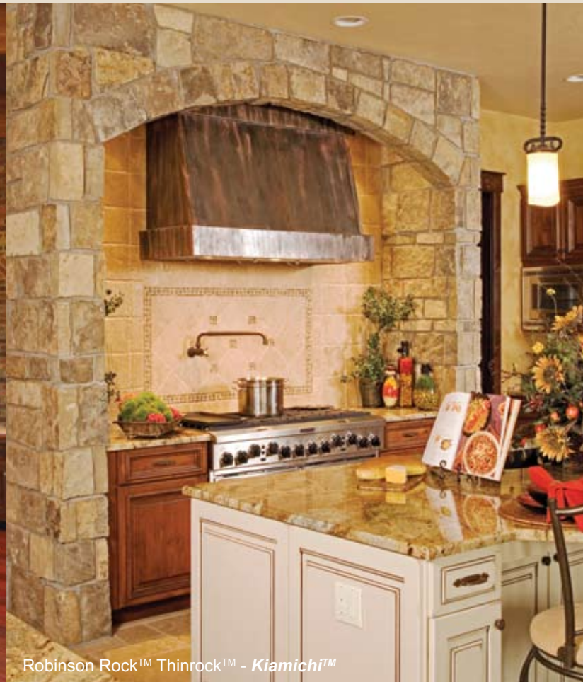
Robinson Rock™ Thinrock™ - Kiamichi ™