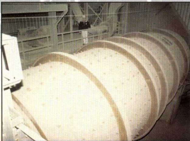
The new finish mill at Keystone